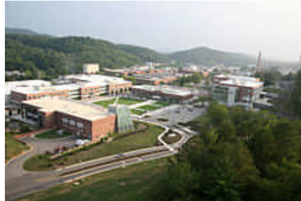
The ORNL campus.

NOTE: THIS EVENT IS RESTRICTED ACCESS. YOU MUST HAVE DOCUMENTS TO PROVE YOU ARE A U.S. CITIZEN. THIS CAN BE A PASSPORT OR BIRTH CERTIFICATE AND A PHOTO ID.